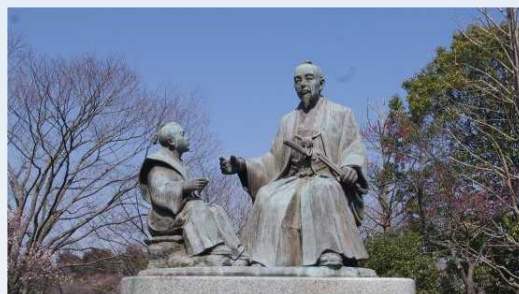
The last feudal lord of Mito Clan and his son, the last Shogun

http://branch1.sjst.jp/kanto/2015English/